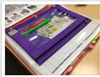
STUDENT AVID BINDER EXAMPLE