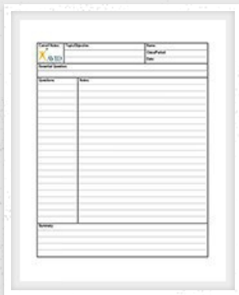
CORNELL NOTE EXAMPLE

Students learn how to ask questions that go beyond memorization and encourage higher-level thinking, providing students with an educational advantage. AVID layers on existing curriculum, allowing teachers to implement AVID strategies into any lesson or subject. Students utilize the Cornell note-taking process to organize their notes and create powerful study tools. They learn to recognize the most important parts of a lesson, create questions to guide their studying, and revisit and refine their notes to solidify learning. Students also learn soft skills, including public speaking, self-advocacy, time management and organization. The ISD is proud to offer AVID to all 6th, 7th and 8th grade students.