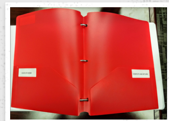
AVID BINDER HOMEWORK FOLDER